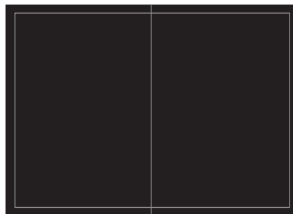
DOUBLE PAGE SPREAD IMAGE AREA 450 mm x 280 mm

Production services are available upon request. All production charges for text changes, digital manipulation, photography, colour lasers and 3DAP proofs are additional to space charges.