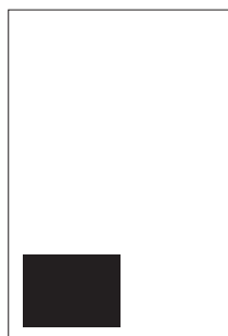
HORIZONTAL EIGHTH 93 mm x 58 mm