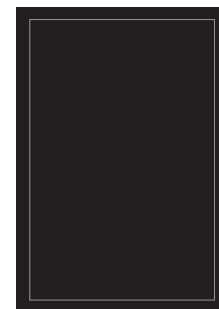
FULL PAGE IMAGE AREA 225 mm x 280 mm