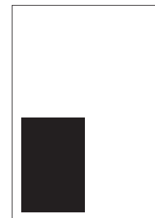
QUARTER 93 mm x 120 mm